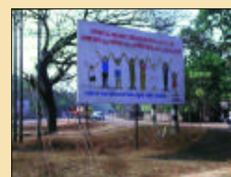
Shertallai, India: Advertising hoarding on the highway. «Let us work together to eliminate LF from the face of Kerala.»