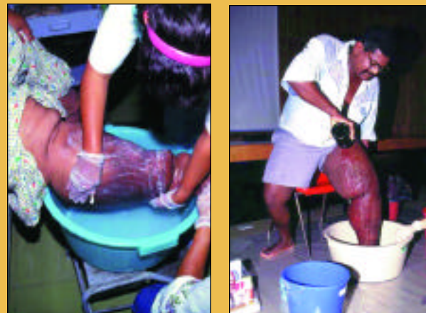
WHO promotes the benefits of simple hygiene activities on affected body parts.