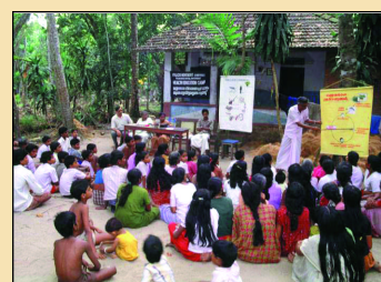
Shertallai, India: Voluntary organizations produce educational materials and coordinate community action against LF.